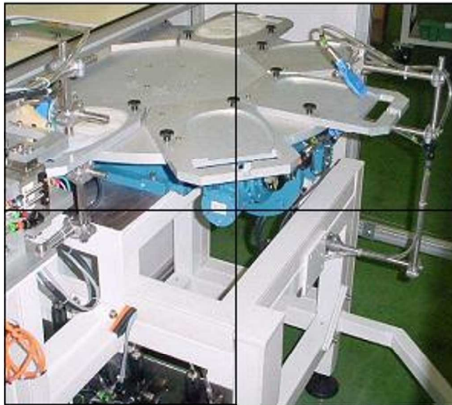
Machine de soudure de poches de recueils médicales

Machine for welding medical collection pocket